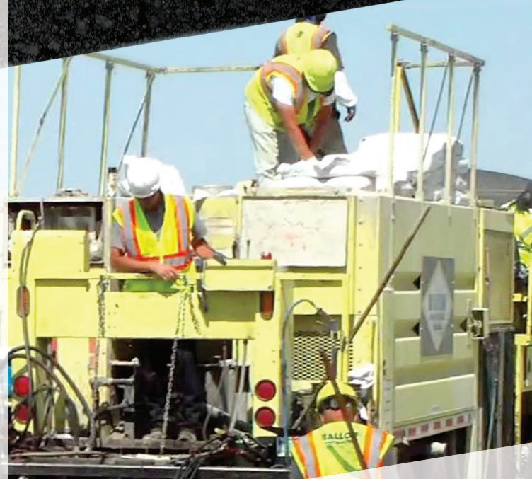
Model 100C Solid Head Transfer Pump